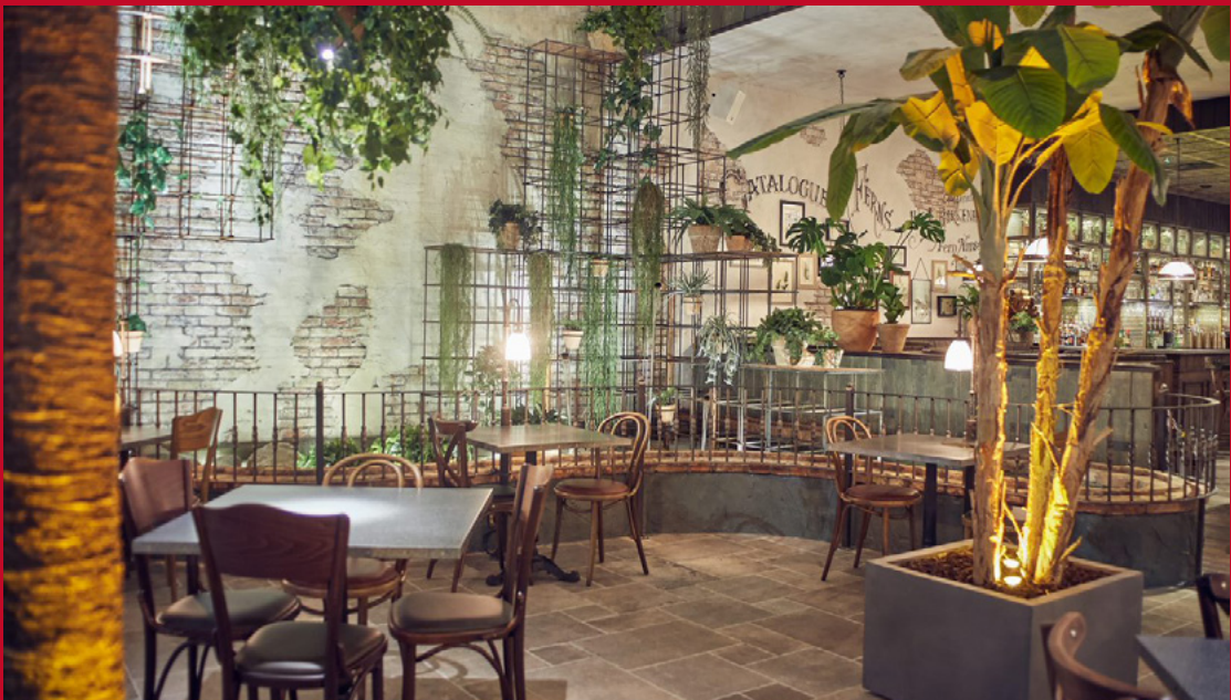
Image: The Botanist, Time Square

proposal submitted for "new concept" motorway service area at Junction 11 on the M62