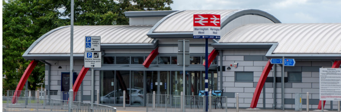
Image: Warrington West Station

was raised by Warrington companies to fund 'second stage' expansions of their proven business models between 2015 and 2018